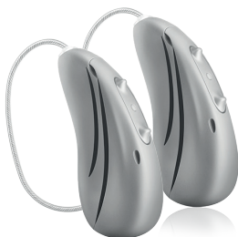
sound E-R shown at actual size

Enjoy the moments that matter with the performance level that matches your lifestyle!