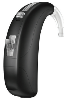
beat SHD 3-RS675

Push button and volume control Earhook or slim tube