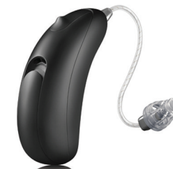
sound SHD 3-S312

Push button and volume control Earhook or slim tube