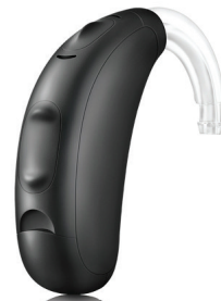
Jam SHD 3-RS13

The SHD 3 BTEs deliver high technology with impressive performance, and robust designs.